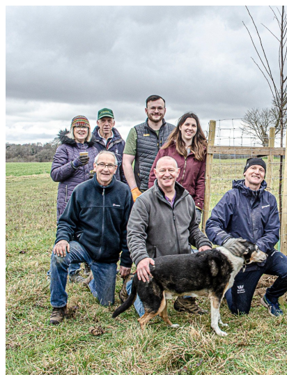
The picture shows some of the new tree acrostitic

Please have a read of this newsletter work of the parish council.