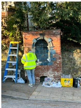
figure clad all weathers bottom of is, is no and was built King Edward it for this and arded as

et into the boundary wall of the then with brown glazed bricks nding a blue glazed tile fountain with n on the top of the structure. On the wall, the inscription reads 'Erected by ople of Eynsford in commemoration Coronation of his Majesty King d VII. MCMII'. For those with a Latin ound, the year was 1902 and was d by Elliott Downs Till.