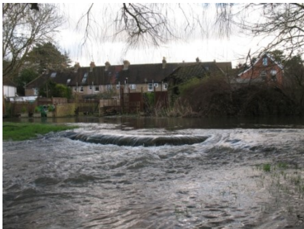
Flood Plain in Action at Common Meadow

In recent years we have seen how vulnerable our society is to the forces of nature. In 2015, storms Abigail, Desmond and Eva resulted in significant flooding across northern England, devastating many homes and businesses, destroying bridges and dividing communities. In 2013, the Kent village of Yalding suffered significant flooding over the Christmas period after local rivers burst their banks inundating many homes, sending torrents down the high street and flooding the village pub! That same year Eynsford saw some of the most significant flooding for many years but fortunately, only a small number of homes were damaged, although clearly one flooded home is too many.