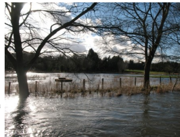
Flood Plain in Action at Riverside

After the floods of 2013 we conducted a village survey to better understand the causes and consequences of flooding in Eynsford and some of that information will help in developing the plan.