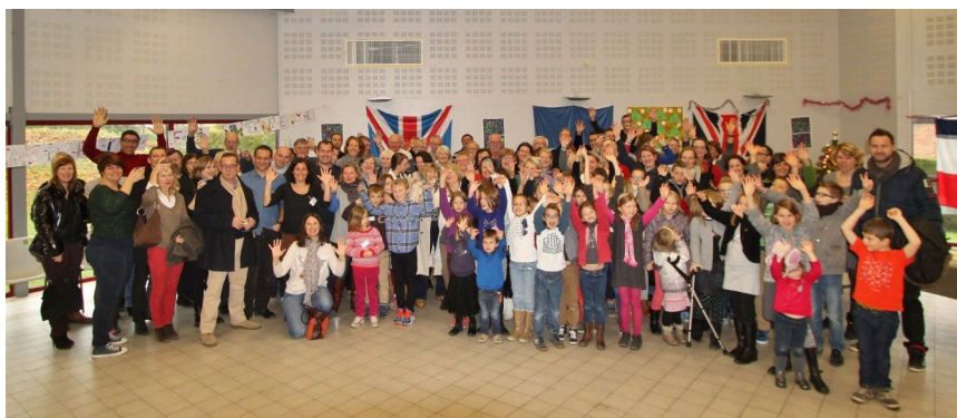
Eynsford & Camphin residents in Camphin en Pèvèle in December

Eynsford and Camphin designed to promote friendship and cultural exchange. Final arrangements are still to be made, but these events will be a time to celebrate our new partnership.