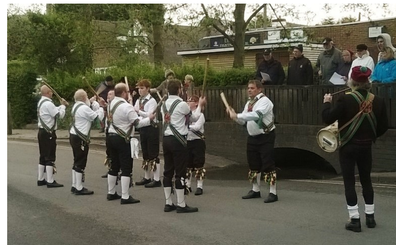
Waddard Morris Men on May Day

Welcome to the Spring newsletter from Eynsford Parish Council.