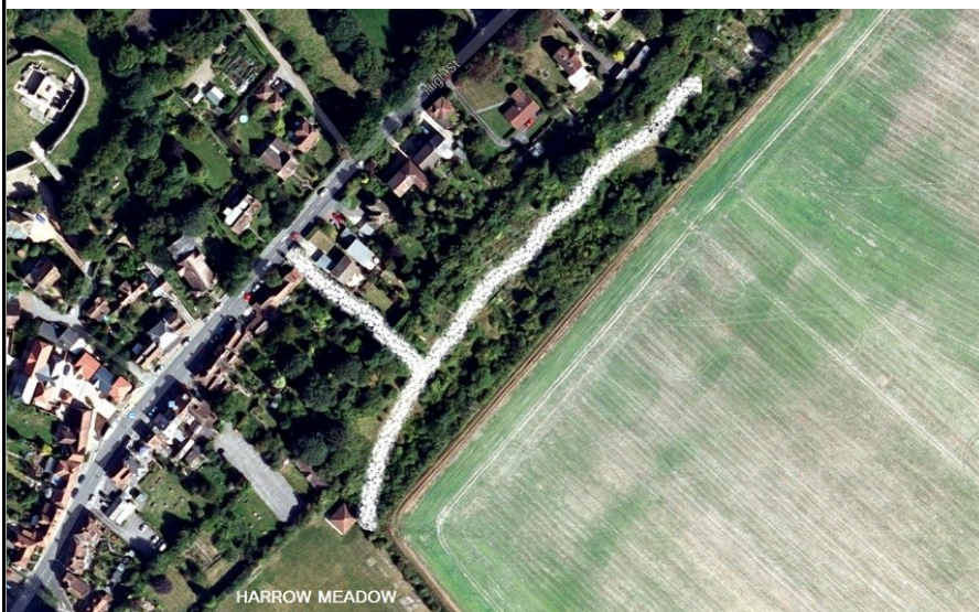
The new footpath is marked in white. Harrow Meadow is at the bottom of the picture.

Phase two of the project, which should hopefully see the path extended up towards Priory Lane, will be announced shortly.