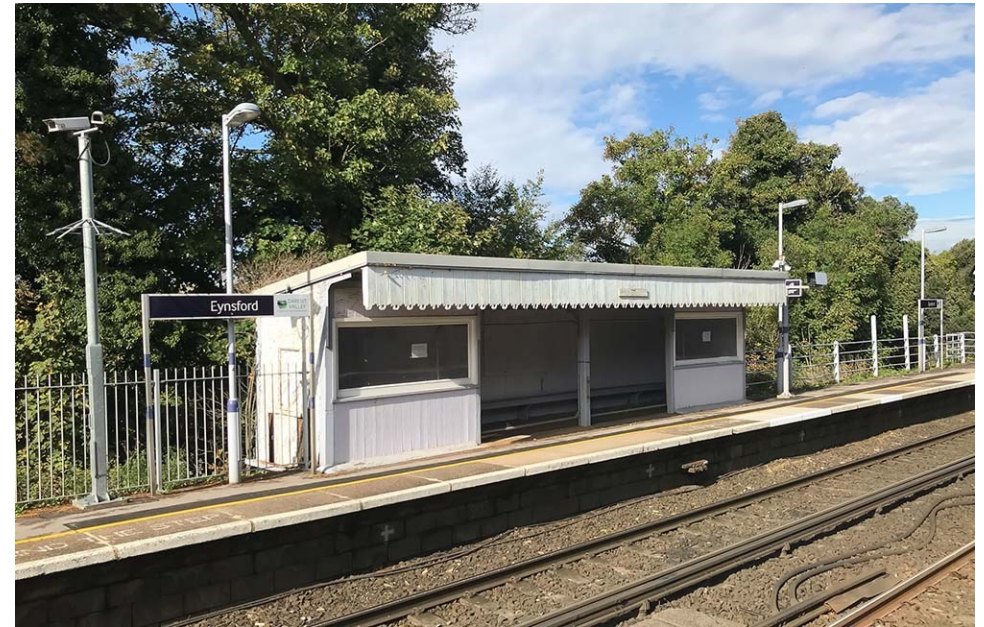
The old shelter which is currently being refurbished.

The rebuilding of the shelter on the up (London) platform is now nearing completion (this is being undertaken by Thameslink) although the project has been delayed due to the requirement for arranging on-track access.